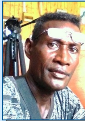
Rellysdom A Malakana Catholic Media Office

The itinerary for Pope Francis's travels to Indonesia, Papua New Guinea, Timor-Leste, and Singapore, which will begin on September 2, 2024, has been made public by the Vatican.